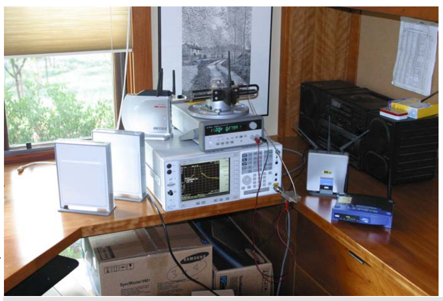
Figure 2 - The spectrum analyzer (an Agilent E4443A) used to monitor air conditions, as well as the five routers tested.

age of three different 180-second runs at four different client locations as are shown in Figure 1. Turntables (see Figure 3) revolving at a 45-second rate were used to minimize the effect of fading at each client location. We used the broadlyavailable (and free) Iperf benchmark [http:// dast.nlanr.net/Projects/ Iperf /] for our tests, specifying 1.5 minutes of upstream (client to router) and 1.5 minutes of downstream (router to client) traffic for each