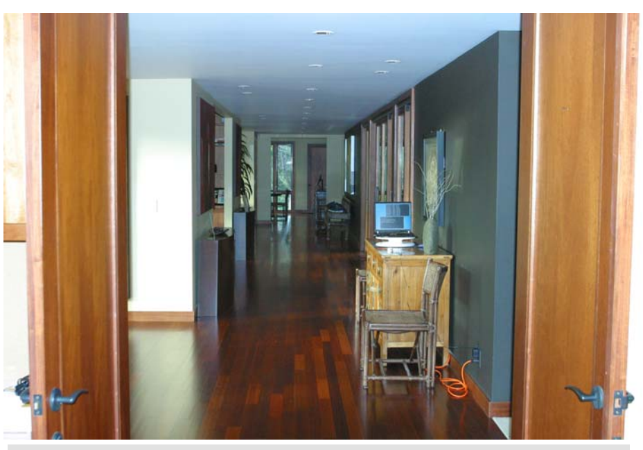
Figure 3 - Looking down the hallway from the location of the router towards Location 3 in the distance. Note the turntable with the ThinkPad.

Except where noted below, we used default configurations for all routers and client drivers. The only change made was to use WPA2/AES/ PSK/TKIP security with a common security key ("myencryptionkey") for all runs and configurations. The assumption here was that a typical residential user would change no settings except security (or, at least, endusers should change security setting!), and would